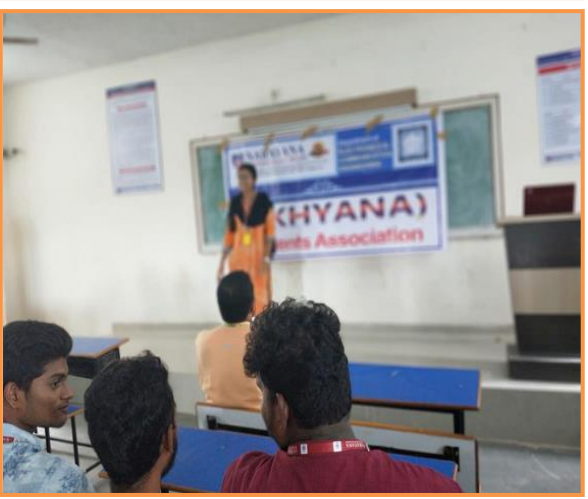
Debate on "Motor Driving act-2019 by II & III ECE Students"